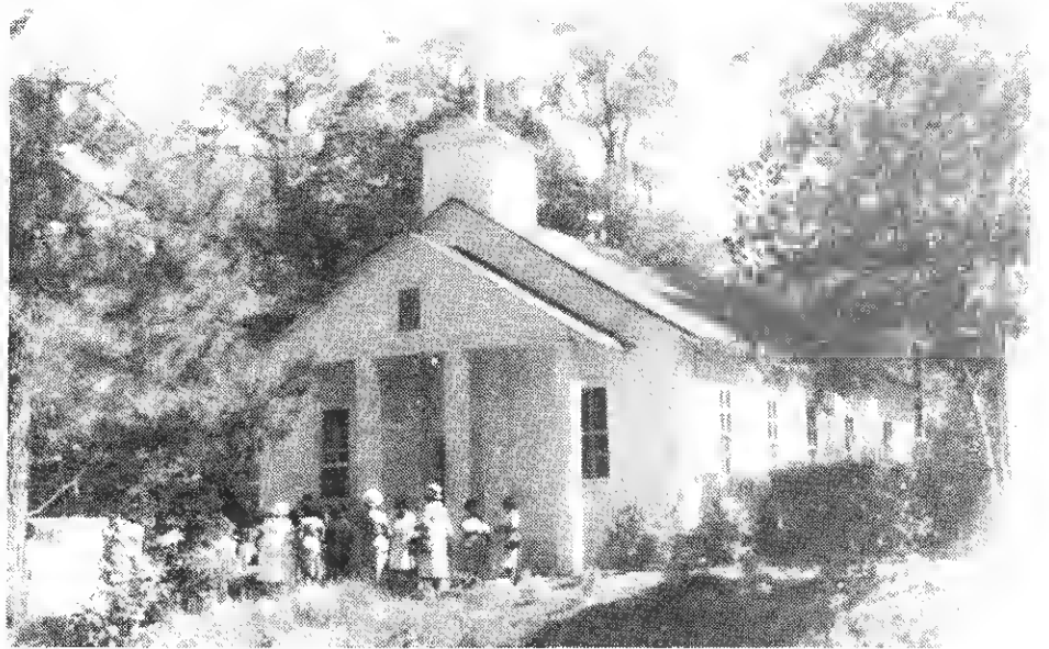
EVERGREEN UNITED CHURCH OF CHRIST, Beatchon, Georgia

POSTMASTER: Send Form 3579 to P.O. Box 29833, Atlanta, Ga. 30359